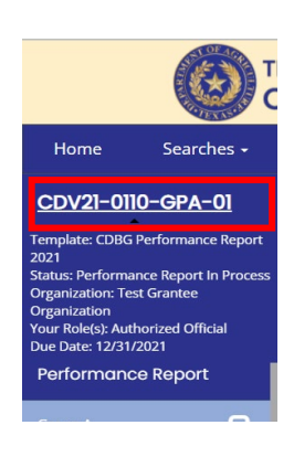
Figure 2. Hover over the application number for the current status

Find the available status options by scrolling down the blue navigation menu. Select the appropriate menu option for the action you wish to take.