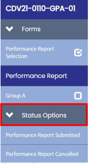
Figure 3. Status options